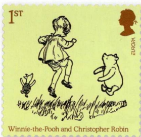
First-class inland letter rate: The friends Pooh, Piglet and Christopher Robin