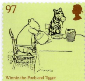
Winnie-the-Pooh and Tigger

88p, Europe up to 40g; Pooh is joined by Rabbit, Kanga, Roo, Owl and Piglet for a party