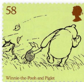
58p basic rate worldwide: Pooh and Piglet walk into the wind on their way to Kanga's