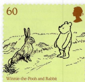
60p, Europe up to 20g: Pooh informs Rabbit about the 'Exposition to the North Pole'

THE BEAR OF VERY LITTLE BRAIN is the star of October's issue, representing this year's Europa Stamp theme of Children's Books. Alan Alexander Milne's 1920's creation was brought to life in order to entertain his young son, Christopher Robin. Pooh was based on a Yorkshire mohair bear (initially called Edward), purchased from Harrods by the boy's mother in 1921 for his first birthday. The next present was a toy donkey, who later became Eeyore and the rest is history... in fact Winnie-the-Pooh's story never seems to go out of fashion – a new film will be out next year. The original toys now reside in safety at the New York Public Library.