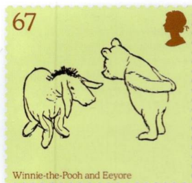
Winnie-the-Pooh and Eeyore

67p basic airmail rate up to 20g; Pooh sings 'Cottleston Pie' to Eeyore